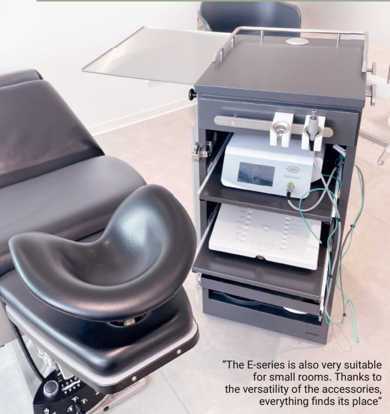
"The E-series is also very suitable for small rooms. Thanks to the versatility of the accessories, everything finds its place"