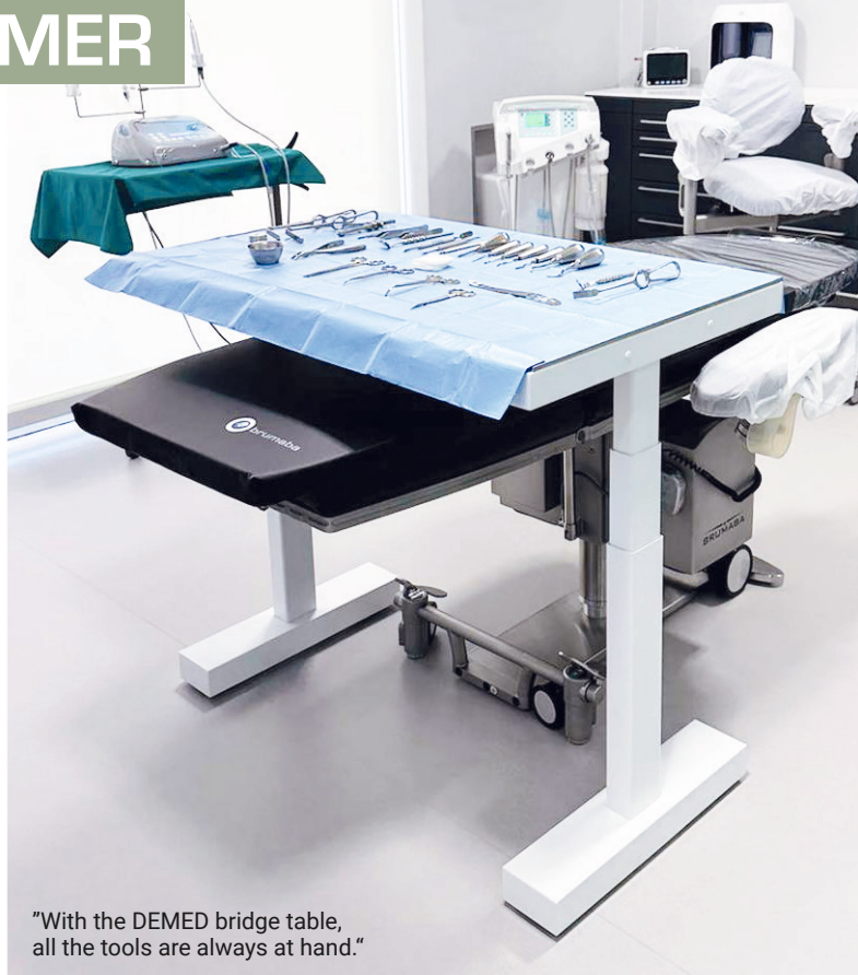
"With the DEMED bridge table, all the tools are always at hand."