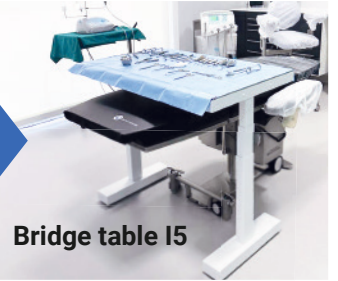
Bridge table I5