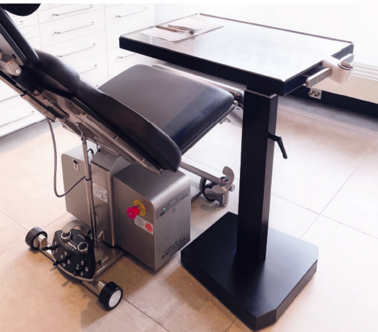
"The instrument table is not only practical, but also very elegant"