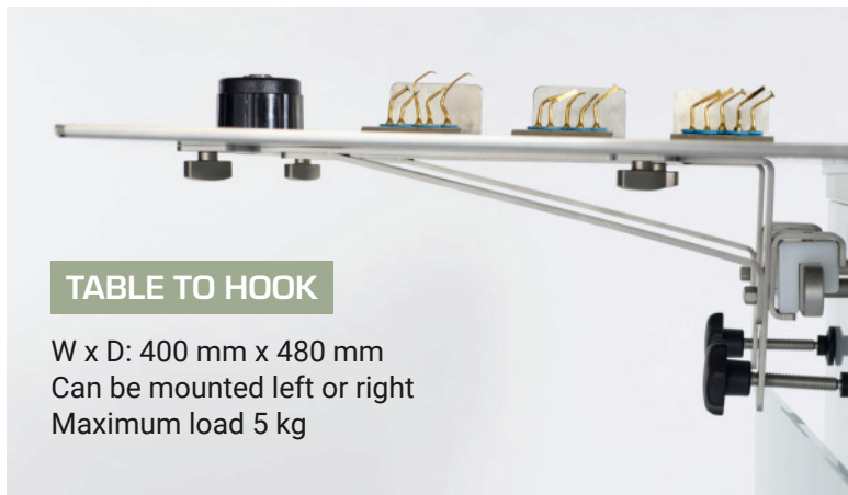
TABLE TO HOOK

W x D: 400 mm x 480 mm Can be mounted left or right Maximum load 5 kg